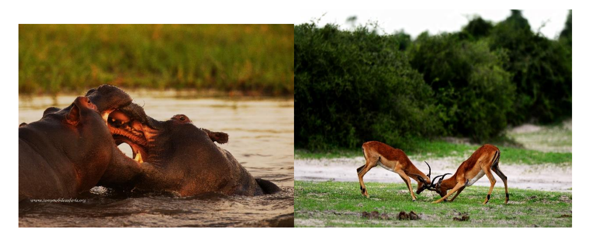
Day 2: Breakfast will be served in the morning before transfer to savuti. Game drive will be around the park where you are likely to spot meat lovers and other animals like buffalos, impalas, zebra and kudus. Lunch will be served at the camp. After lunch time have a quick shower and rest. An afternoon game drive will follow in which you will view a perfect sunset. After nights and dinner will be served at the camp.

Day 1: The pick-up point by our tour guide at your respective place. Have a short time for shopping at kasane hunter's mall. A boat cruise will follow which will be done on the Chobe River. You will have the opportunity to view different animal species like elephants swimming in the river, giraffes, hippopotamus and different kind of birds. After a boat cruise lunch will be served at one of the local restaurant where you can have our local dish. A game drive will follow in the chobe national park leading to the camp site where you will be accommodated. Your accommodation will be mobile tents. Dinner will be served on the camp.