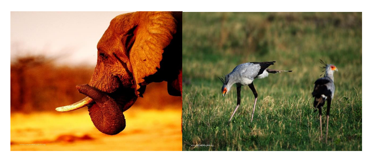
END OF THE TRIP!!!!!!!!